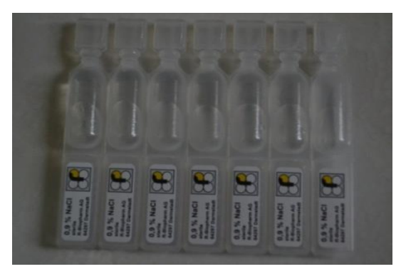
Figure 1b: Natrium Chloride solution