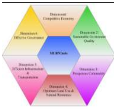
Figure 2: MURNInets Framework (Source: JPBD, 2015)

In Malaysia, the MURNInets framework is an initiative to measure the sustainability of cities in Malaysia and is monitored by the Federal Department of Town and Country Planning. The framework incorporates Happiness Index Study, which consists of six dimensions. From this, 36 indicators were derived. In raising sustainable community, the Happiness Index evaluates