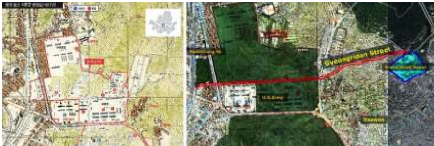
Figure 1: Formation of Gyeongridan Street (a) 1927 Map; (b) Overlay with 2014 Map

business owners afterwards. In total over 50 shop owners were interviewed including the ones who participated in our survey. The profile of the interviewee and respondents were predominantly non-gentrifiers who had either lived or run businesses in the neighborhood for many years; many of them were born and raised in the area. All our respondents were Koreans; 40% were female and the rest were male. Some of them are tenants and some run their business in buildings that they own. All interviews were conducted in Korean and the quoted part was translated into English by the authors. Conversation with some interviewees who refused to be recorded were reconstructed based on our notes. To respect their anonymity, we refer to all of our interview subjects, stores, and community organizations by general descriptors.