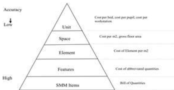
Figure 3: Level of accuracy that could be achieved using the available information

Figure 3 illustrate the level of accuracy that could be achieved using the available information listed (Oforeh, 2008; Potts, 1995). It shows how crucial it be to adopt SMM in preparing detail BQ to achieve high accuracy in cost and contract management.