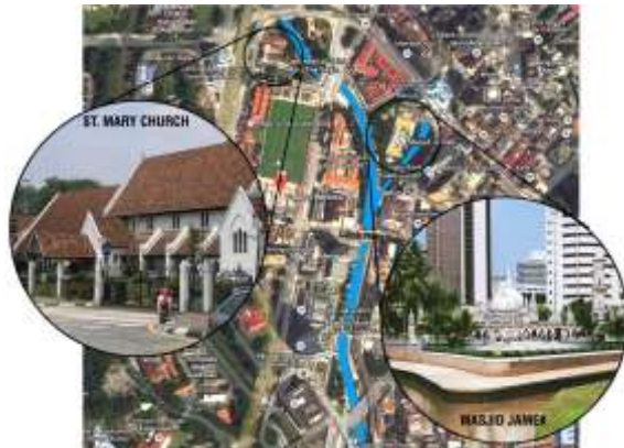
Figure 7: St Mary's Church and Masjid Jamek

Summarize from the precedent studies, the activities along the river is closely related to its usage diversity. From the analysis, it was found that there is a need to activate people to go to the river. It will make them appreciate and value its heritage. The master plan for each river is to connect and link it with the heritage building thus creating a vibrant continuation of activities along the river. To execute the ROL Project at Precinct 7, this master plan technique was proposed and implanted. The potential of dynamic space and static areas was mapped along the Precinct 7 River (Figure 8).