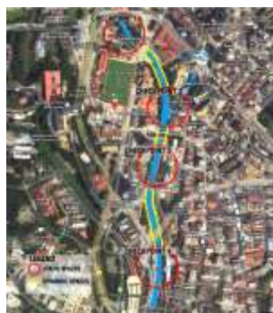
Figure 8: Mapping of the Potential Dynamic and Static Spaces

Summarize from the precedent studies, the activities along the river is closely related to its usage diversity. From the analysis, it was found that there is a need to activate people to go to the river. It will make them appreciate and value its heritage. The master plan for each river is to connect and link it with the heritage building thus creating a vibrant continuation of activities along the river. To execute the ROL Project at Precinct 7, this master plan technique was proposed and implanted. The potential of dynamic space and static areas was mapped along the Precinct 7 River (Figure 8).