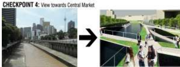
Figure 9: Illustration of Checkpoints Revitalization Possibility