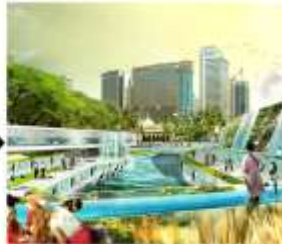
CHECKPOINT 3 : View towards Menara Bumi