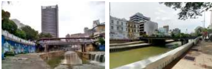
Figure 4: Bridge Conditions at Precinct 7, ROL Project

Gombak and Klang Rivers along this precinct 7 are not suitable for water transportation mode because of the dimension and size of the river that is too small. Even if the river is being widened in the future, the bridges crossing the river are too low for boats to pass through (see Figure 4). Adapting the Cheonggyecheong River strategy, instead of boat riding along the river for touring and sight seeing the heritage buildings, people need to experience the site by walking along the river. And by doing this, they do not only appreciate the nearby heritage buildings, but they shall also value the river by the experience and touch of the river.