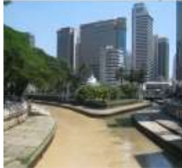
CHECKPOINT 2 : View towards Masjid Jamek

The dense and historically sensitive nature of the Heritage Quarter shall only allow controlled redevelopment and urban infill as the primary method of revitalization. The main aims are to increase the activities within the area and increase people traffic flow with better accessibility to all places potentially regarded tourist attractions. The juxtaposition of everyday life and the history, striking adjacency shall be created between an event that is experienced in the present and event that was built in the past (Figure 9). It is possible for the River and heritage area to become extensively linked up through open space and streetscape using existing spaces.