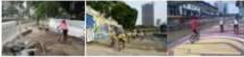
Figure 5: Bicycle Convoy along the Precinct 7, ROL Project

There is only one section of the river at Precinct 7 that maintains its ecological system (Fig. 6). This site does not only give the opportunity for the river to filter the water naturally but also to implement sustainable water management system to improve on-site storm water quality. We should utilize our tropical climate as this climate environment supports a great diversity of flora and enable the rapid establishment of biodiversity. By restoring natural river features, functions, and in-stream habitat, the river shall reconnect back nature with the people. A place like this shall create a vibrant, bio-diverse environment and focus on specific habitat for amphibians, fish, insect or birds. Native species and naturalized planting should dominate this area and throughout the stretch of the river.