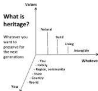
Figure 1: What is Heritage?

Heritage is a property that is inherited. UNESCO (2007) interpreted that heritage is “our bequest or tradition from the previous generation, what we live with today and what we engaged on to the future”. Figure 1 shows the meaning of heritage defined in a simpler graphic.