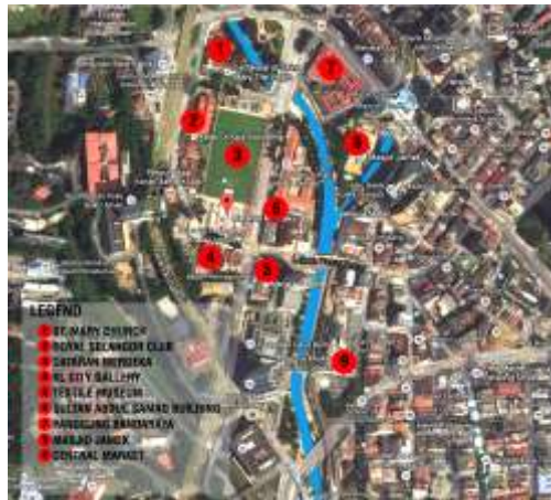
Figure 3: Heritage Building nearby the Precinct 7, ROL Project.