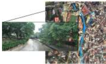
Figure 6: St. Mary's Church Ecological River

There is only one section of the river at Precinct 7 that maintains its ecological system (Fig. 6). This site does not only give the opportunity for the river to filter the water naturally but also to implement sustainable water management system to improve on-site storm water quality. We should utilize our tropical climate as this climate environment supports a great diversity of flora and enable the rapid establishment of biodiversity. By restoring natural river features, functions, and in-stream habitat, the river shall reconnect back nature with the people. A place like this shall create a vibrant, bio-diverse environment and focus on specific habitat for amphibians, fish, insect or birds. Native species and naturalized planting should dominate this area and throughout the stretch of the river.