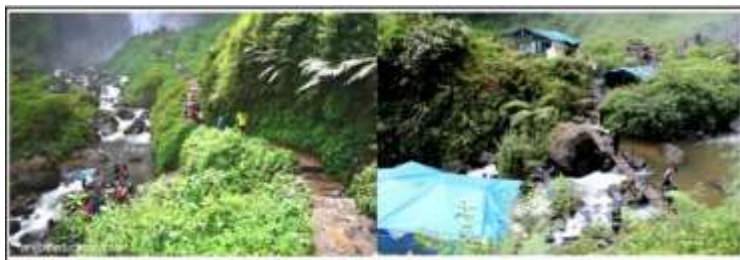
Figure. 3: View of Sipiso-Piso Waterfall

Someone will value experience depending on their expectation, situation, context, and resources offered (Ginting et al., 2018). The result showed that most respondents had positive perception toward Sipiso-Piso and visited there later (local people: 3.14; domestic tourists: 2,27; foreign tourists: 3.29).