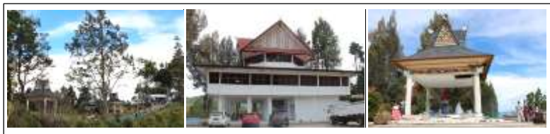
Figure. 2: Existing Buildings in Sipiso-piso waterfall

the existing buildings (restaurant and gazebo) with eclectic architecture style (traditional roof of Karo Culture) was considered as historical buildings (see figure 2). This misperception occurred due to low understanding of the definition and meaning consist of historical building indeed.