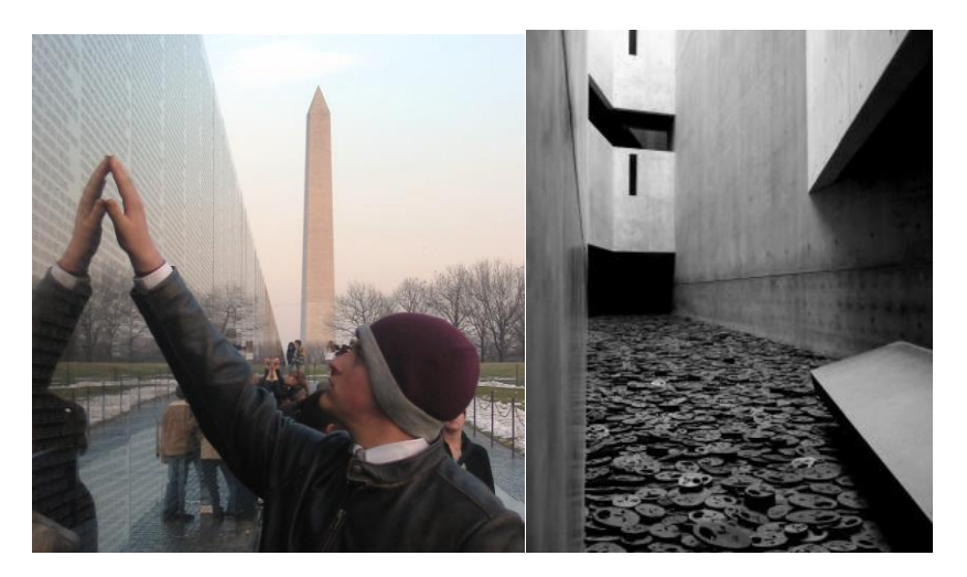
Fig.2. (a): Touching the Memorial Wall; source: Wikimedia, (2005). http://en.wikipedia.org/wiki/File:TouchWall.jpg. And (b) the "Memory Void" where a visitor is invited to walk on metallic faces in the Jewish Museum; source: http://www.katrinkalden.net

A few number of the western architectures succeeded to represent valuable symbolic values in the sense of the paper's aim. The Memorial Wall of Washington DC is one of the successful projects because its highly appreciated implicit symbolism. It has taken tenth ranking on the list of America's favorite Architecture by the American Institute of Architects. The memorial consists of two gabbros' walls that retain the earth ground behind them. Engraved names of martyrs of the Vietnam War appear on highly reflective black stones. Visitors can see their reflections on the stone wall simultaneously with the engraved names. This aims at symbolically connecting the past and present. The symbolic theme quietly presented in a park mixes simplicity and clarity. The embedded passion of sacrificing oneself for others is full of meaning. This meaning presents itself in easy architectural vocabulary that quietly expresses sorrow that does not overlook values of pride.