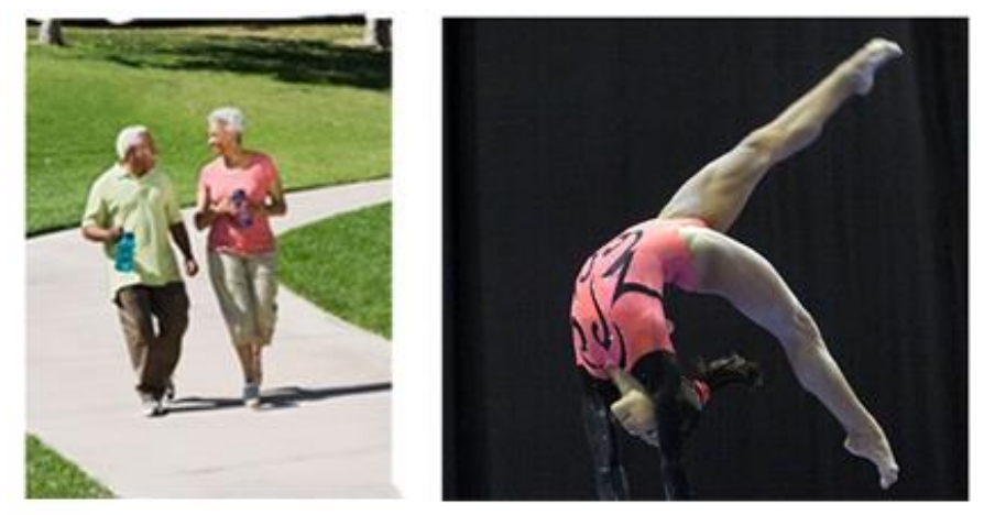
Fig.1. (a) Familiarity of normal satisfaction; versus provisional impressive pretention (b); source: Gymnastics Inside magazine.(2012) http://perfect10.rustyparts.com/wp-content/uploads/hong_1.jpg

supposed outsider, shape of a human body balance may be much more logical to be normally settled horizontally on four legs like many animals, than erecting vertically on just two feet. Human long proportioned body would rather be laid on the ground like many reptiles than stand in a contradictory state to balance principles of masses. A pencil in an analogous shape of body cannot be stable when left standing on its extremity point. However, the human body can walk, run, bend, carry weights with one hand, and even stand on a single foot, to amaze any truthful arbitrator observer. The remarkable non logic kinetic situations have never drawn attention due to one's taking for granted the easiness of their happening.